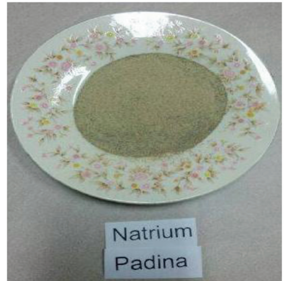
Figure 1 Sodium alginate extraction padina sp.

The research has been done in the Laboratory of Biopharmaca and Pharmaceutics Laboratory of Hasanuddin University Faculty of Pharmacy. The conducted resulted in the extraction of sodium