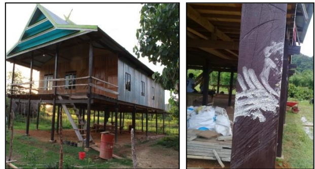
Figure 1 The house on stilts (left) and the hand-print traces (right) of the mabbedda bola rite on October 4, 2018 in Leang-Leang Village.

When turning, parents/in-laws and homeowners take turns inscribed handprint on the outer side of the post. The rotation pattern in the traditional practice of mabbedda' bola , produces hand-prints at several posts, sometimes even forming a stacked images. In the procession around the house as an effort to passili' bola (Bugis) or appasili' balla (Makassar) in every corner, Panrita bola will stop reciting mantras/prayer, followed by the parents/in-laws of the owner of the house while sprinkling the passili' water concoction that was brought. Here it is seen that the symbolic act of rejecting reinforcements is not a handprint, but a passili' water concoction. Hand-print as a symbol of "approvalessing" which contains a cultural statement.