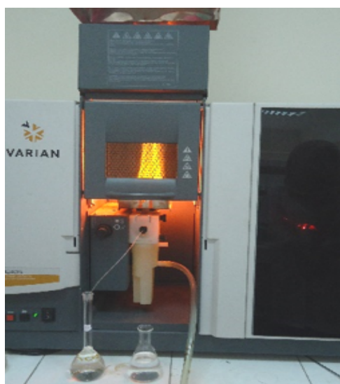
Figure 3 AAS machine is reading the sample