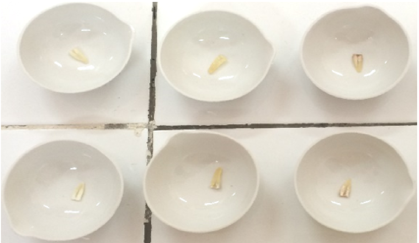
Figure 1 Samples are ready to be applied EDTA