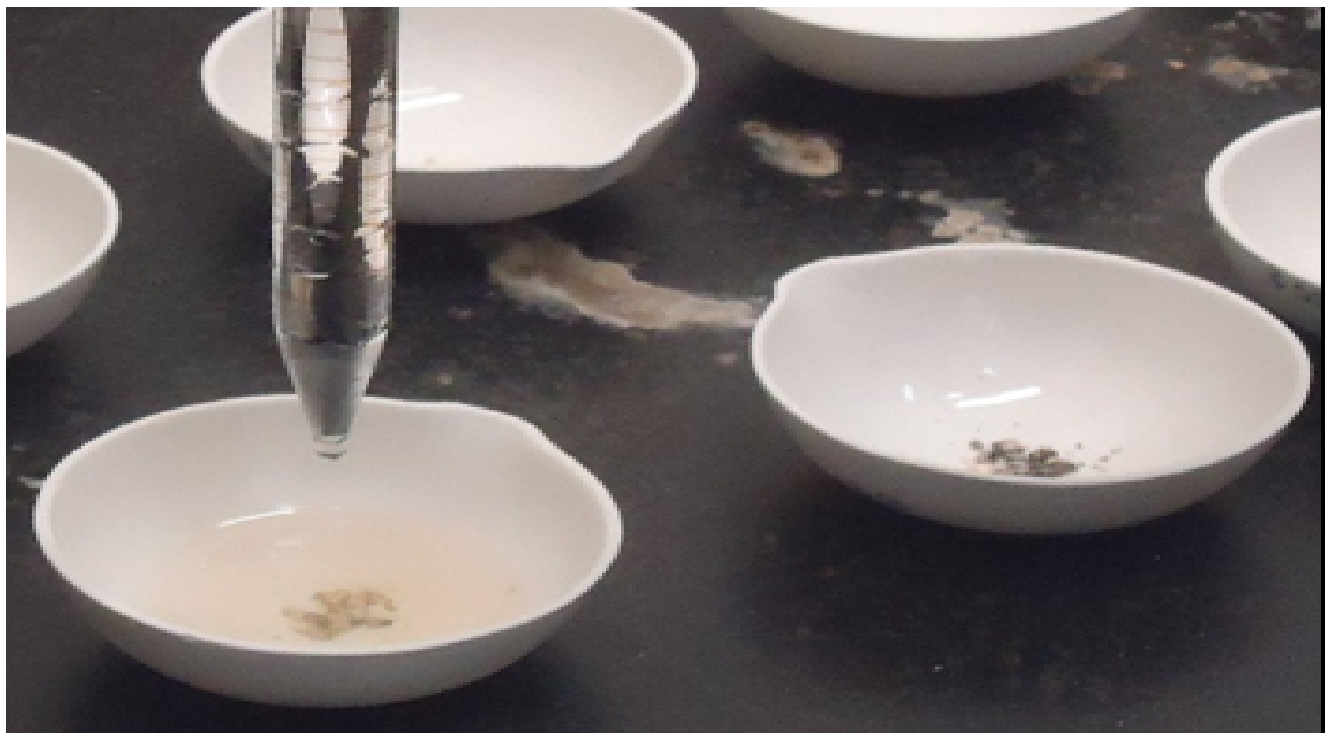
Figure 2 Samples are dissolved with heated 10 ml of HCl 10M, then mixed with HNO 3 0.1M until it reached 100 ml