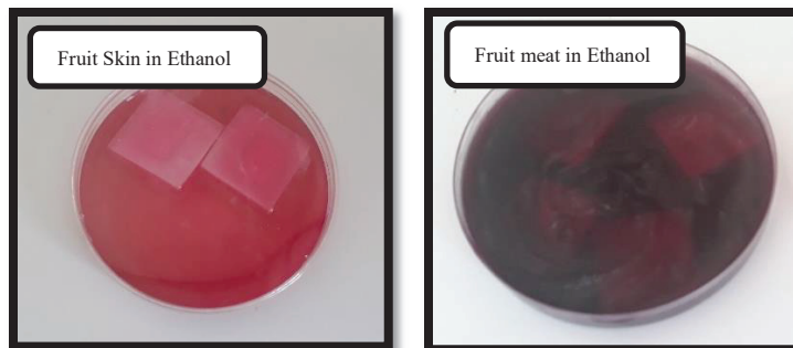
FIGURE 2. The light color of dragon fruit skin dissolved in ethanol solvent (left) compared to the darker color of dragon fruit meat dissolved in ethanol solvent (right).

Variations in the length of immersion time were 12 hours, 24 hours, and 48 hours. Each semiconductor has a maximum limit in dye extraction absorption. The length of 48 hours of immersion \text{TiO}_2 has been seen to begin to dissolve in dye. The length of immersion affects the absorbance value. The more extended the immersion time, the higher the concentration of anthocyanin molecules absorbed on the Particle \text{TiO}_2 . The longer the immersion, the darker the color of the layer. The skin and meat fruit showed different colors (Figure 2). The dye from the meat was darker.