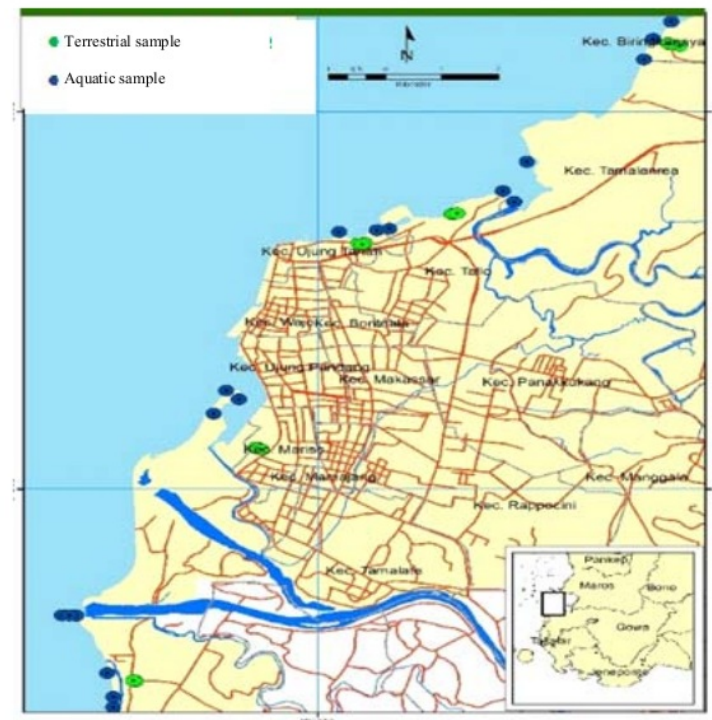
Fig. 1: Map of aquatic and terrestrial samples collection at four districts of Makassar Coastal areas

Soft tissue of shells and crab were removed and cut in section of small pieces at the end the homogenized representing samples were frozen prior being analyzed 7 .