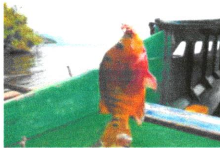
Figure 1. Louhan, the invasive fish species in Lake Matano.

Historically, the introduction of fish has been practiced since Indonesian colonial times, in the 19 century [14], including introduction into inland waters [15]. The number of fish species introduced to Indonesian inland waters was not less than 17 species, mostly as cultured species [15,16], and 16 fish species have been introduced into Sulawesi inland waters. Channa striata , locally known as ikan gabus, was stated as the first introduced species into Indonesian inland waters in 1915, followed by Cyprinus carpio (locally named ikan mas), from China and Japan, in 1920. The introduction of Barbonymus gonionotus (local name tawes) and Trichogaster pectoralis (local name, ikan sepat) in 1937 into Tempe Lake, have successfully increase fish production of the lake, and even considered to reach the highest fish catch in the world, producing 980 kg/ha/year [16].