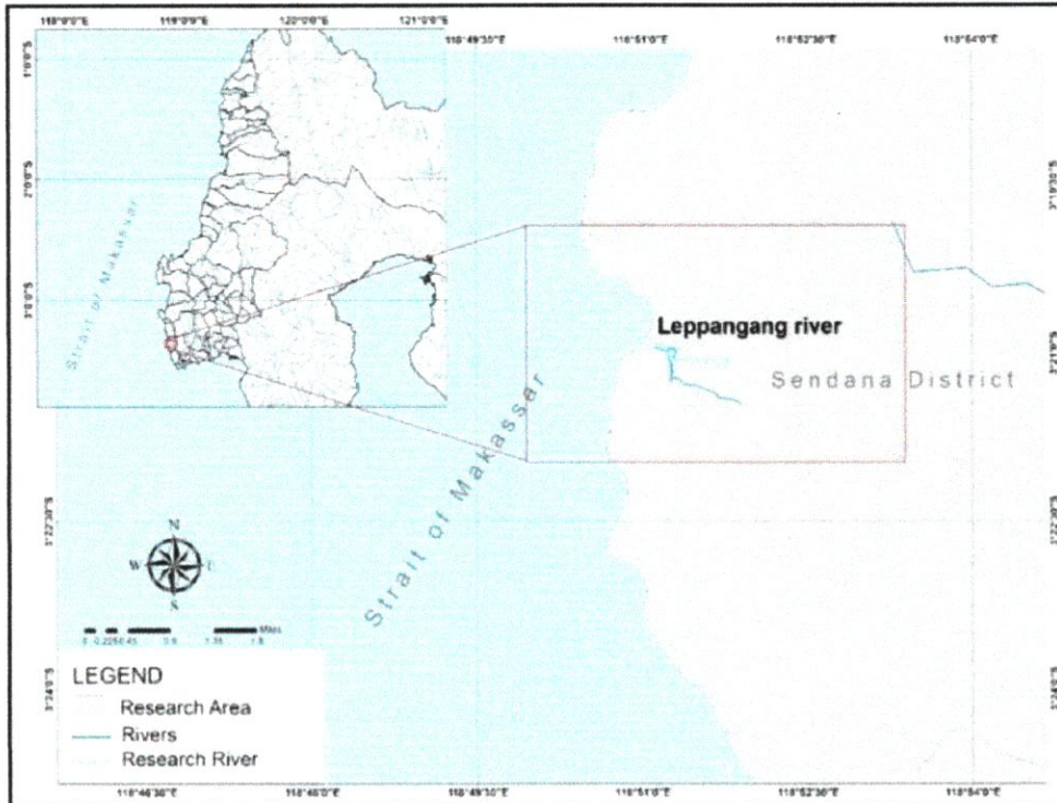
Figure 1. Sampling location in Leppangan river, West Sulawesi.

Statistical analysis. The composition of penja fish species is calculated and compared descriptively that is made in graphical form using Microsoft Excel 2016. The composition of the species is calculated by the equation (Fachrul 2007):