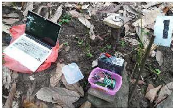
Figure 2. Installation of the solar light intensity data acquisition system on site

The performance test includes testing the function of each module about the suitability of the design results, as well as testing the performance of data recording. This system is placed under the auspices of cacao trees (figure 2) and left for two weeks. The ability of the system to acquire light intensity data is recorded every minute in 24 hours until the power on the battery runs out. A new battery is then installed to retrieve data that has been recorded without the need to unplug the memory card. Recorded data and recording time are observed to find out if there is data lost at a certain time, both during the recording process, and when data collection. Furthermore, the sun light intensity data is plotted into the graph to determine the distribution pattern of light intensity in 24 hours recorded by this system.