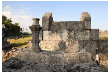
Figure 3: Hulu Keris Tombstone at the Tomb Complex of the Kings of Hadat Banggae

When the importance of culture is discussed to see how far the ancient Tomb Site of the kings of Hadat Banggae is related to culture, ethnicity related to the Mandar Tribe will be included.