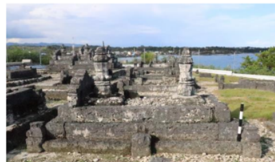
Figure 1: Tomb of the Kings of Hadat Banggae of Majene Regency (Erwin U Saraka, 2021)

Administratively, the location of the research location, the Tomb Complex of the Kings of Hadat Banggae is included in the Pangali-ali neighborhood, Pangali-Ali Village, Banggae District, Majene Regency, West Sulawesi Province. To facilitate access to the site, you can refer to the Majene Regent's Office, from the east by going through a settlement a distance of ±850 m (See Figure 1).