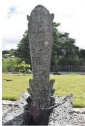
Figure 6 Wear on the surface of the wooden headstone (Doc. Andi Oddang, 2020)

The use on the surface of the wood causes the surface to become slippery so that it is no longer visible. Observations on the headstone show the worn part is found on the motif so that the shape and writing on the headstone is not clearly visible. There are nine worn wooden tombstones.