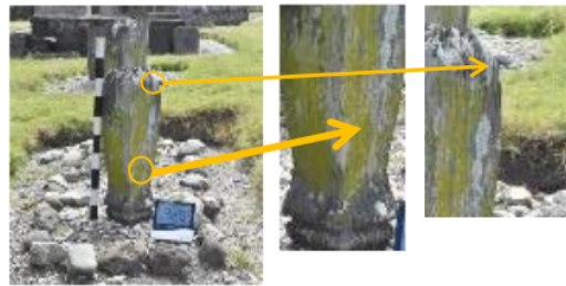
Figure 8 Moss on the surface of a wooden headstone

Based on observations, a total of 64 wooden headstones were overgrown with moss. The impact of fungal growth is the removal of stains on the surface of the wood. The resulting stains are green, bright green and blackish. The further impact of fungal growth is to cause weathering. According to the information, the wood material used for the manufacture of the headstone is Sappu wood (Mandarnese language) or ulin. The environmental condition of the headstone is four meters from the ketapang tree.