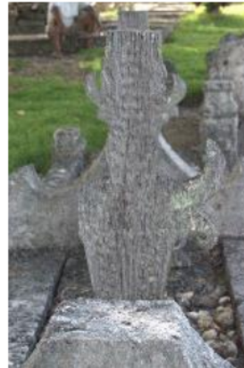
Figure 5 cracks in the wooden headstone (Doc. Andi Oddang, 2020)

Vandalism in the form of beatings (in the process of making /forming work) can also result in the cracking of the work or the loss of some material. The scavenging and shrinkage caused by temperature can alter the physical properties of brick materials. Heat fertilization or movement can produce a force strong enough to cause a rift [1]. Fractured objects or wakes can be caused by two things, firstly, the shift in the center of gravity of some building components so that there is a shift in the weight force to achieve a new balance, and secondly, due to a decrease in the carrying capacity of the building. under the structure. The shape of the cracks due to the movement of the structure of the building is usually large at the top and smooth at the bottom [1]. This can happen in both stone and wood objects. In addition, uncontrolled human activity factors can be the most fatal cause of damage to cultural reserves. Observations at the tomb complex showed that 37 headstones had suffered mechanical damage in the form of damage and obliqueness. The observable form of damage is fractures and 7 oblique headstones. The damaged part of the headstone is the trunk on the legs and shoulders, as well as the head of the headstone. In addition, on the headstone part is also found fragments of ornaments.