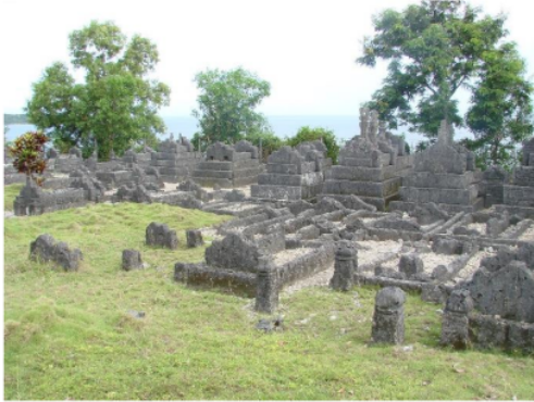
Figure 3. Biological Weathering of the ancient tombs

Biological weathering of the stone tombs, some graves are attacked by moss, algae, lichen, and are overgrown with several lower plants. This condition can exacerbate the damage to those previously damaged, both in the unstable position of the tomb and the feeding condition that tends to have degraded material. Damage to graves that have weathered due to moss [11].