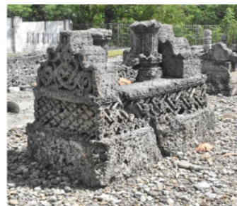
Figure 2 Physical damage to large cracks in the tomb

Degradation of materials on cultural heritage objects due to the potential for the environment and climate that carries destructive elements. This destructive factor triggers other damage, such as when the salt content in the rock increases, the salt is carried by water or wind. When the temperature is high, the salt carried by the water enters through the pores of the rock. Salt that has entered the body of cultural heritage objects, if the temperature around the salt is low, then the salt will turn solid in crystalline form. This condition is if the salt has increased the temperature inside the object, then the salt will find a way out through the pore. The pressure of salt will form postules on the surface, a kind of boil or bubble on the surface of the object. If this happens repeatedly and there is no rescue treatment, the postules will break, leaving a trail of holes in the object (see figure 2). The rock surface in the tomb looks rough and in some parts there are holes. Severe cracks in the wall of the mesh.