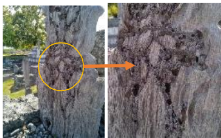
Figure 7 One of the wooden gravestones that was attacked by termite insects

Based on observations, there is a wooden headstone that suffered a termite attack on the body of the headstone. This tombstone is in the first sector area.