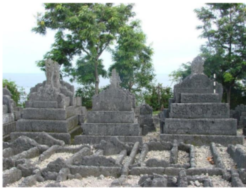
Figure 1 Physical damage of ancient tombs (Doc. Andi Oddang, 2020)

Besides being able to cause postula on the rock, salt can also corrode, high salt levels can make the rock more brittle, experience degradation.