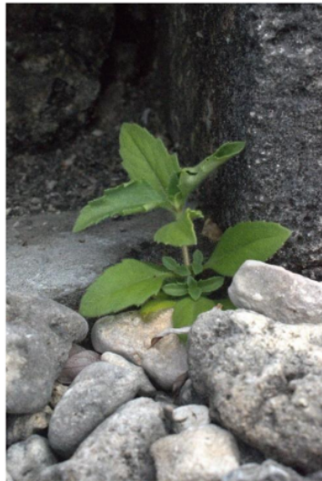
Figure 4 Biological weathering on the stone tombs overgrown with low-level plants (Doc. Andi Oddang, 2020)