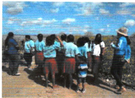
Figure 2. Field trip to the Nature

The introduction of Mangrove to elementary students is expected to give knowledge about types of mangrove around the coastal area and to grow awareness on the importance of mangrove in our lives. The activity is not only conducted in the classroom, but the students also learn from nature to see directly the mangrove around the coastal area of Samkai Urban Village, Merauke Regency (figure 2). As for dominant mangrove types around the coastal area of Merauke are Avicennia and Rhizophora sp. It is in line with research by [4], which explain based on the identification on mangrove in Samkai Urban Village, there are four species. It consists of Rhizophora , Avicennia , Aegliceras , and Sonneratia . This introduction activity through natural school is a nature-based concept which gives the personal impression for students to see, touch, feel, and follow the activity in nature. Consequently, the learning process will be fun and students will gain more awareness on how important mangrove for our lives and the effect which arises from damaged mangrove around us.