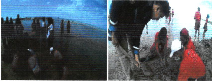
Figure 3. Mangrove Plantation

Merauke Regency. The activity attended by fifth-grade students of YPPK Buti, teachers, college students and lecture of Musmus Merauke University.