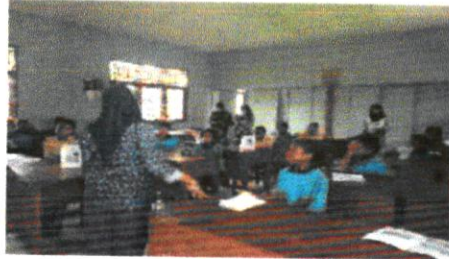
Figure 1. Material delivery about Mangrove and Booklet