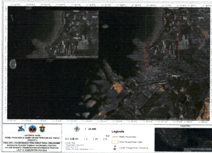
Figure 1. Location of the research station.

solution as much as 10 mL and 70-72% perchloric acid (HClO 4 ) solution of 0.5 mL until all the meat was immersed in the reagent solution and destroyed or the foam is gone. Then heated on a hot plate equipped with temperature control until it reaches a temperature of 500°C. This heating is done until all samples are destroyed or dissolved. Then the sample is left until it is completely cold, then diluted by spraying distilled water on the erlemeyer flask wall while filtered using Whatman paint No.1 in the measuring cup until the volume reaches 50 mL. The results of this destruction are then analyzed to determine the concentration of metals contained in the sample.