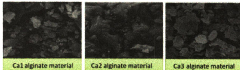
Fig. 1. SEM analysis result on several calcium sulfate formulation of alginate material made of brown algae Sargassum sp.

The results of one-way ANOVA LSD post-hoc test showed that the comparison between alginate impression material Sargassum C3 formula and T3 formula with control material showed no significant differences ( p > 0.05 ) which means that the setting time of the formula corresponds to the standard impression material that circulates in the market.