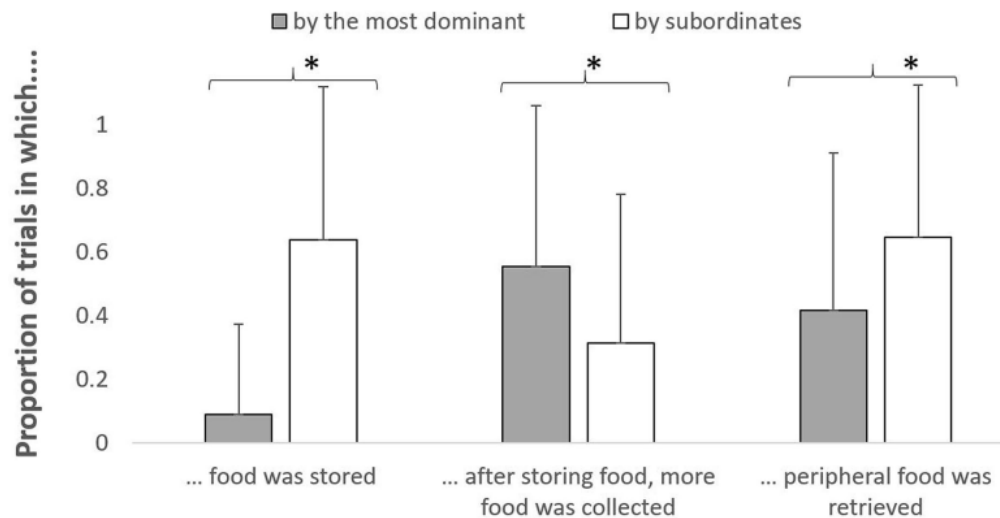
Figure 1. For dominants and subordinates separately, mean (+ SD) proportion of trials in which macaques stored food, in which they collected more food after storing one piece, and in which they retrieved peripheral food. Significant differences are marked with an asterisk.

We further tested whether the probability of collecting peripheral food was higher in subordinates, and differed across species (Model Sub1, GLMM: \chi^2 = 29.11 , df = 5 , p < 0.001 ). Our results showed that subordinates were more likely to retrieve peripheral food, and this was true across all species (Tables 1 and 2; Fig. 1). Moreover, the probability that subordinates collected food when dominants turned their back to the food varied across species (Model Sub2, GLMM: \chi^2 = 8.13 , df = 2 , p = 0.017 ; Tables 1 and 2), being higher in JM1 than in MM4 ( p = 0.005 ; Fig. 2). Also, the probability that subordinates retrieved food by dissimulating differed across species (Model Sub3, GLMM: \chi^2 = 8.36 , df = 2 , p = 0.015 ; Tables 1 and 2), being higher in JM1 than in MM4 ( p = 0.034 ; Fig. 2). Finally, the probability that subordinates retrieved food when dominants were involved in aggressive conflicts