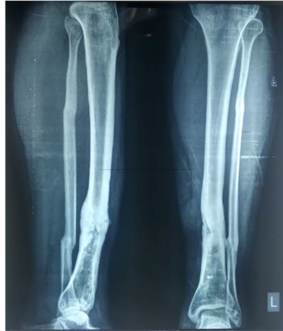
Fig. 2. Plain radiograph of the patient.

We noticed a hyperpigmented area on the skin graft after two years of follow-up with no exposed bone nor soft tissue defect. There is no limitation in the patient's daily activity, and he has been able to return to work four months following the surgery (Fig. 4).