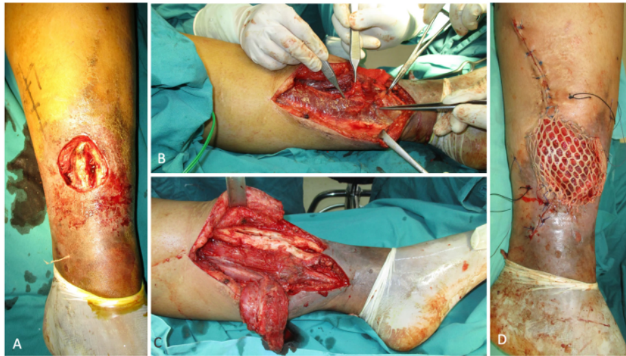
Fig. 3. A 5 cm × 6 cm of soft tissue defect with exposed tibial bone intraoperative (A). Meticulous dissection and identification of pedicle arteries for soleus muscle (B-C). Split thickness skin graft with diamond-shaped mesh pattern is applied onto muscle flap.