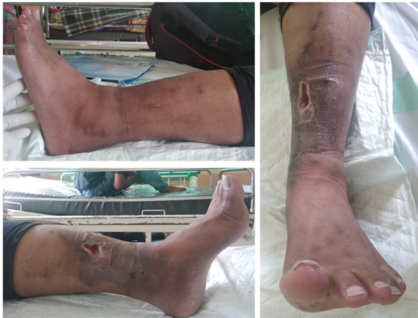
Fig. 1. The infected wound at the medial distal third of the left crus with active pus production.

Chronic osteomyelitis is sometimes challenging to manage. Historically, it is often associated with high rates of recurrence and secondary amputation. Treatment for chronic osteomyelitis is complex, multifaceted, and usually requires multidisciplinary